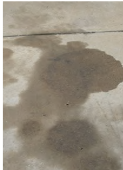
Before photo showing concrete driveway with large, deep oil stains

renewal application may be required to keep peak efficiency. Steam cleaning will kill some but not all bacteria. Again, a renewal application may be necessary if steam cleaning is required as part of the maintenance process. Store all containers in a cool, dry facility.